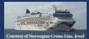
Jewel