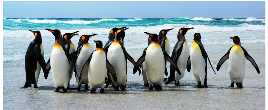
Penguins in the Falkland Islands.

Discover the beauty and rich history of Ireland as well as the coast of the British Isles. Walk the Royal Mile from Edinburgh Castle perched high on the hill to the 17th-century Holyrood Palace, the British Monarchy’s official residence in Scotland. Delight in vibrant Belfast’s ornate Victorian and Edwardian architecture, gracious gardens and friendly pubs. And an overnight in Dublin gives you time to see the magnificently decorated Book of Kells is on display at the venerable Trinity College as well as stroll through lovely St. Stephen’s Green, a beautiful city park