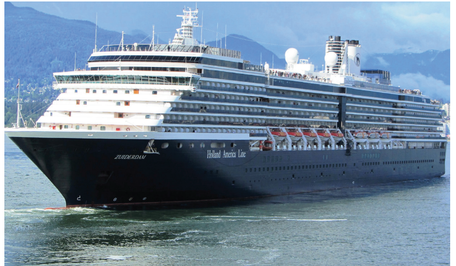
Holland America Line provides unique experiences. | Photo / Holland America Line

Roundtrip sailing options are available from a variety of convenient, easy-to-reach port cities in Northern Europe, the Mediterranean and the U.S. East Coast, including Amsterdam, the Netherlands; Barcelona, Spain and (new round-trip option in 2020);