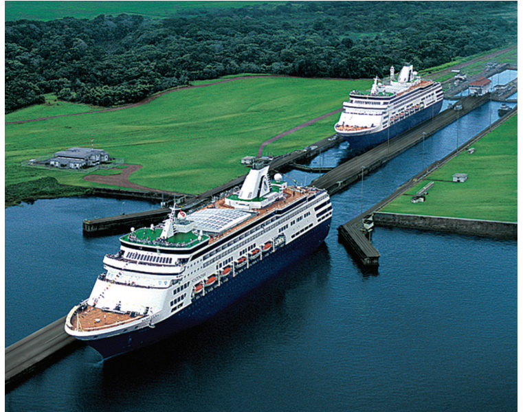
A ship in the locks. | Photo / Holland America Line

Content provided by our advertising partner