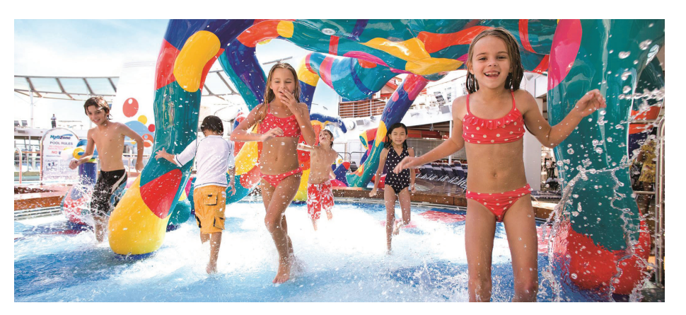
Children enjoy the onboard amenities. | Photo / Royal Caribbean Cruise Line, H20 Zone

Available in the ships library, this area offers classic and popular family titles in a variety of languages (based on the ship's itinerary) and a comfortable reading area for kids to relax and delve into a book, individually or with a parent.